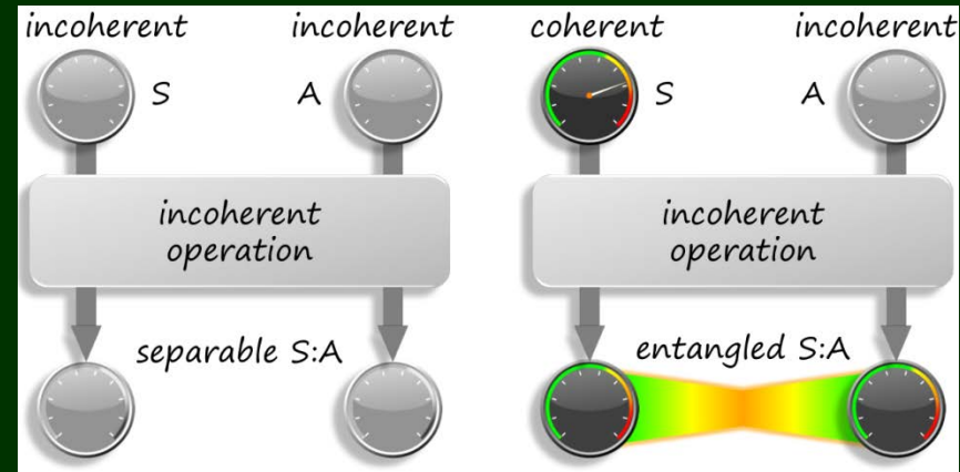
Equivalence between quantum coherence and entanglement