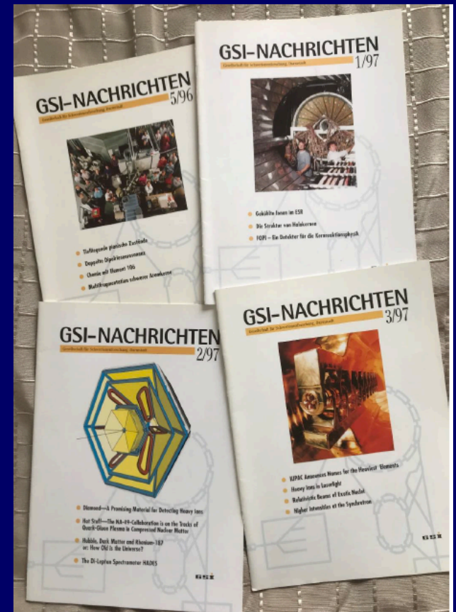
Editor and later responsible for the newly designed GSI News