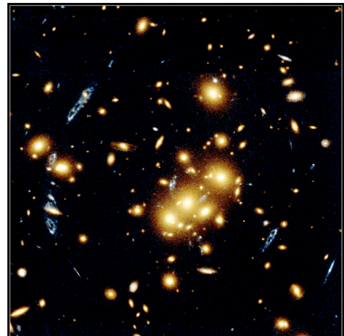
Gravitational Lens Galaxy Cluster 0024+1654